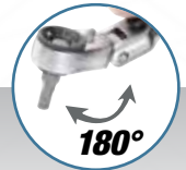
Hinged ratchet for bits