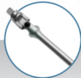
T-handle key with jointed square drive