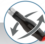
Reversible ratchet with revolving handle