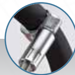
Flexible spinner with handle